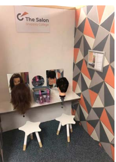
The role play area before and after its transformation

Earlier this year, the Hairdressing Department at Sheppey College transformed the hairdressing role play area at Sheerness' soft play centre, 'Kidz City', into a miniature replica of the College's Salon.